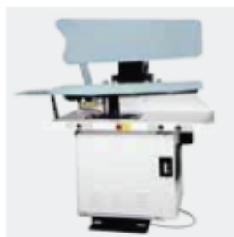
FPA3-D leg shape press