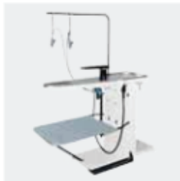
FSU1 spotting table

A wide range of options and accessories (trolleys, bases, condensing units, etc) is also available, ask our local offices!