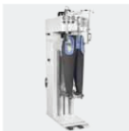
FTT1 trouser topper