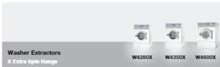
Washer Extractors X Extra Spin Range

● standard ○ option x available – not available