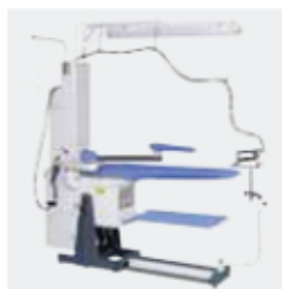
FIT2WC ironing table