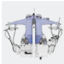
FSF2 shirt finisher