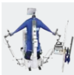
FFT-S form finisher