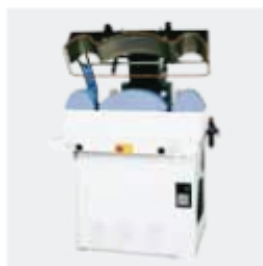
FPA6-WC collar and cuff press