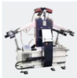
FSF3 shirt finisher