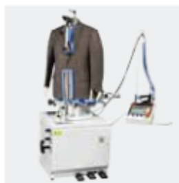
FFT-D form finisher